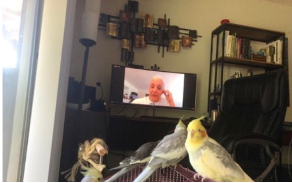
Cockatiels adopted from Mickaboo watch the Virtual Adoption Fair

How do you do a bird adoption fair when everyone is sheltering in place?